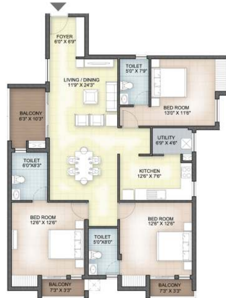
3 BHK - 1647 SQ. FT. - NORTH FACING