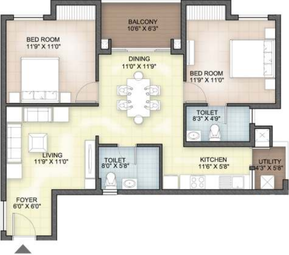
2 BHK - 1107 SQ. FT. - SOUTH FACING