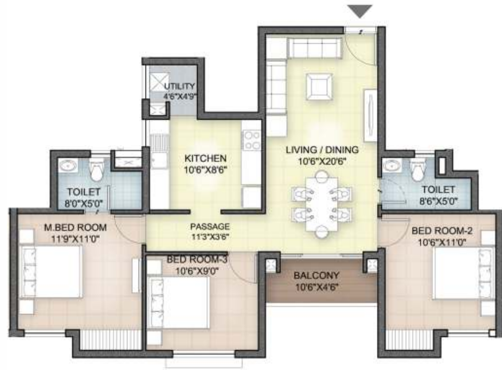
COMPACT 3 BHK - 1183 SQ. FT. - NORTH FACING