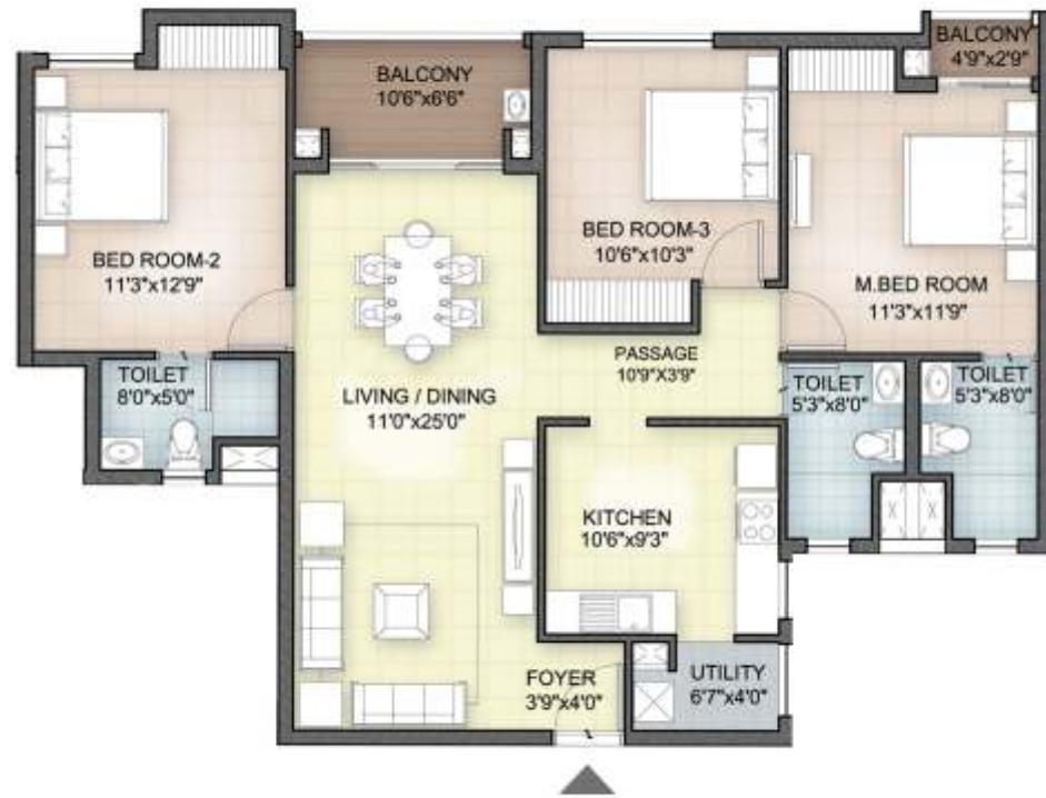
3 BHK - 1447 SQ. FT. - SOUTH FACING