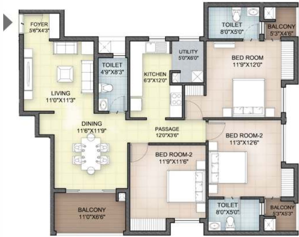
3 BHK - 1558 SQ. FT. - WEST FACING