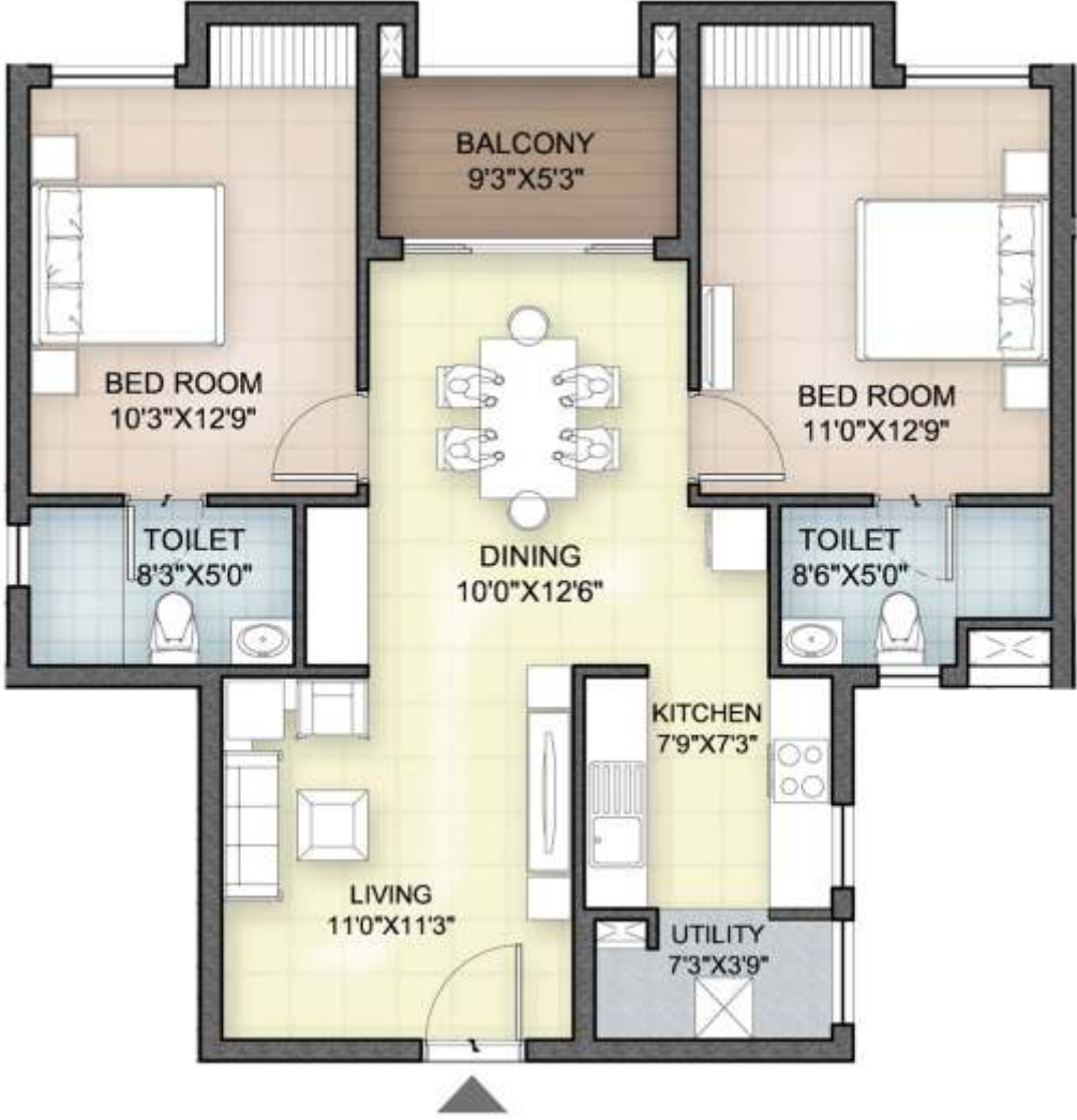
2 BHK - 1062 SQ. FT. - SOUTH FACING